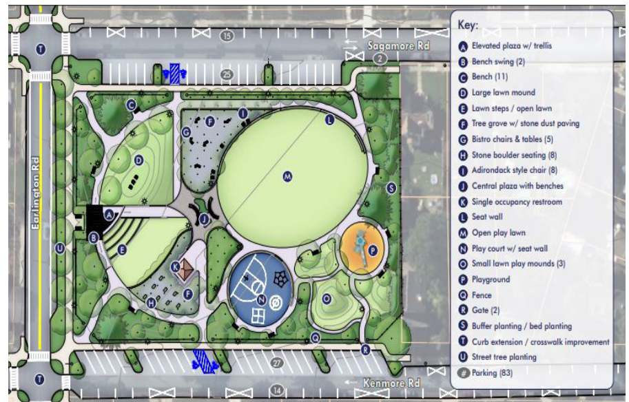
Picture of Master Plan rendering

Phase 2 is tentatively scheduled to begin early next year and will focus on the perimeter of the park including sidewalks, parking, and fencing. Check out future editions of the HavaGood Times for updates.